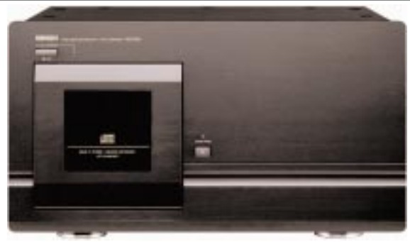
DCM-5001: Slave unit for DCM-5000

The DCM-5000 features 24 bit Alpha processing, which is the world's first technical formula for reproducing an analog waveform from the reproduction of 16-bit data in 24-bit quality.