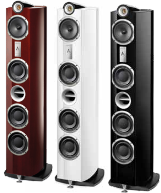
SIGNATURE - ALPHA

Every product from the Signature range is available in 3 finishes: A mahogany varnish finish, a black lacquered piano finish or a white lacquered piano finish.