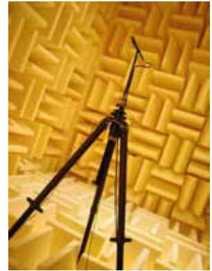
Anechoic chamber developed for high end products

“ This luxury craftsmanship combines the highest level cabinetwork with TRIANGLE's acoustic expertise. ”