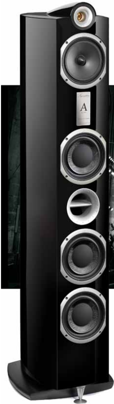
SIGNATURE - DELTA