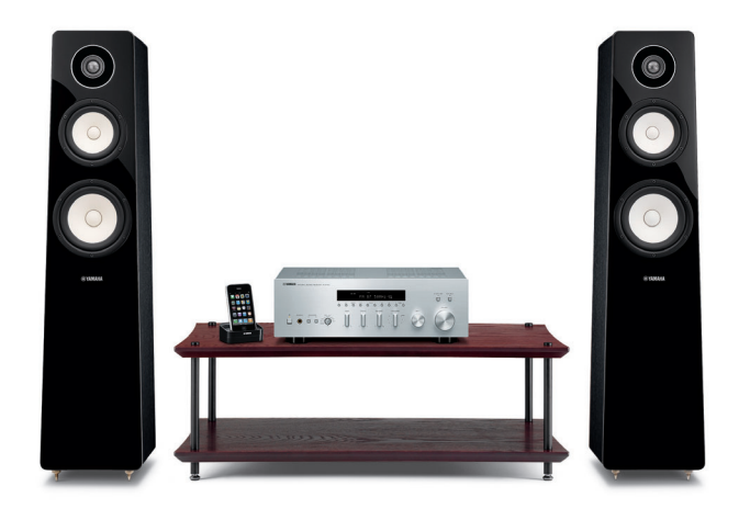
HiFi Receiver System for High Quality iPod Sound

R-S700 Receiver + YDS-12 Universal Dock + NS-F500 Speaker System