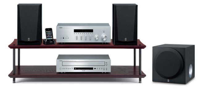
Non-Stop Music System Including iPod Integration

R-S700 Receiver + YDS-12 Universal Dock + NS-F500 Speaker System