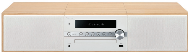
X-CM56(W) Horizontal speaker setup