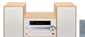
Vertical speaker setup