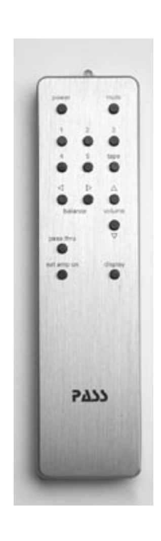
You are ready to play music

It's always possible that something may go wrong. If so, don't get excited. We know It's really aggravating when a product doesn't work, but it will get fixed, and often it's something really simple.