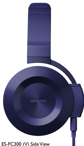
ES-FC300 (V) Side View