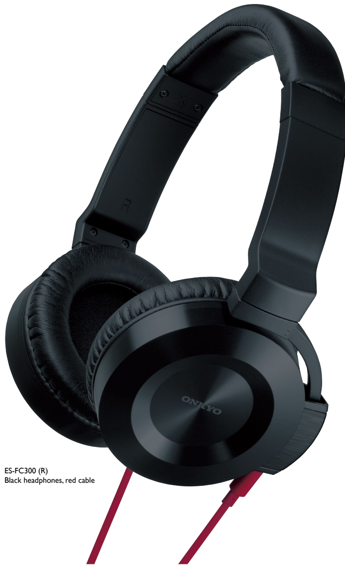
ES-FC300 (R) Black headphones, red cable