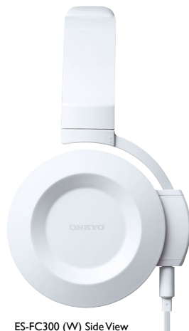
ES-FC300 (W) Side View