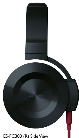
ES-FC300 (R) Side View