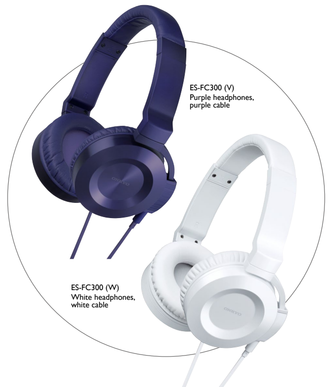
ES-FC300 (V) Purple headphones, purple cable