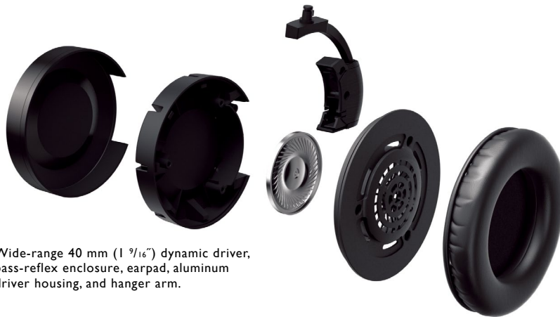
Wide-range 40 mm (1 9/16") dynamic driver, bass-reflex enclosure, earpad, aluminum driver housing, and hanger arm.