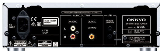
C-755(S) Rear View

Text on components may vary with region.