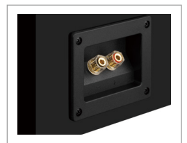
D-175(B) Rear View