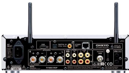
R-N855(S) Rear View

Text on components may vary with region.