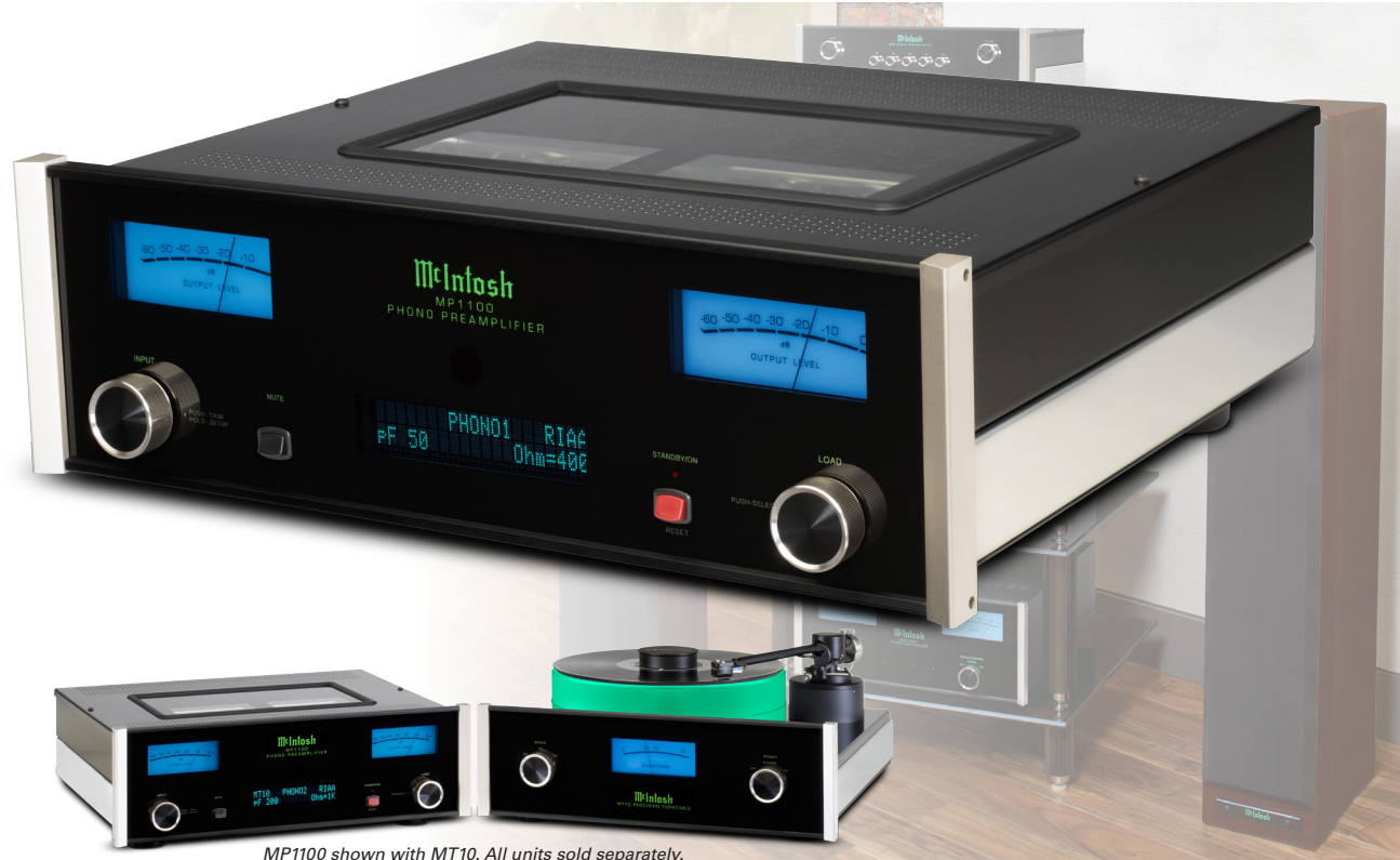
MP1100 shown with MT10. All units sold separately.