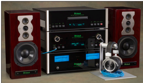
Left: C47 shown with optional MC152 amplifier, MCT450 SACD/CD Transport, XR50 speakers and MHP1000 headphones. All units sold separately.