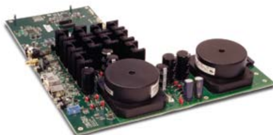
Main PCB, featuring separate analog and digital toroidal power transformers. Oversized, extruded heatsinks for each individual voltage allow the system to run cool.