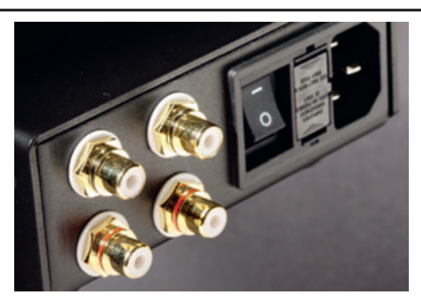
ABOVE: Not two inputs but a combination of L/R stereo input and variable preamp output, controlled off the same volume control as the two front headphone sockets

new HD 800 (reviewed on page 76) and my established budget favourite, the Audio Technica ATH-AD700. Despite negligible differences in their frequency responses, the Black Cube consistently sounded warmer and fuller-bodied.