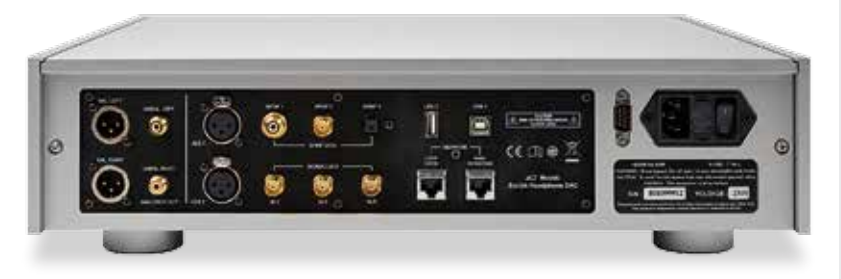
ABOVE: Digital inputs span S/PDIF (two coax, one opt), two AES/EBU (on XLRs), one USB-A for external HDDs, one USB-B for computer connection and a network loop (on RJ45s) – joined by clock I/Os (on BNCs) and variable analogue outs (RCA and XLR)

emanating from the synthesised flute voice. This patchwork quilt of samples of widely differing quality was revealed in no uncertain terms, yet it was all strung together in a pleasingly coherent way.